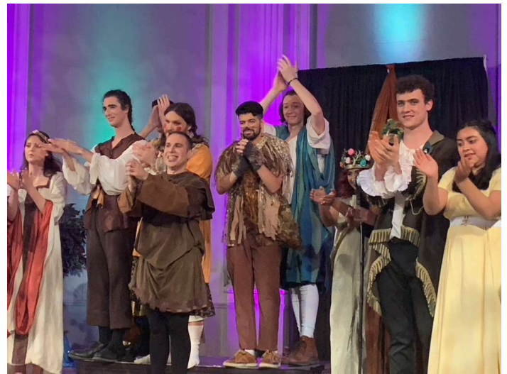
Delighted cast members join in the applause